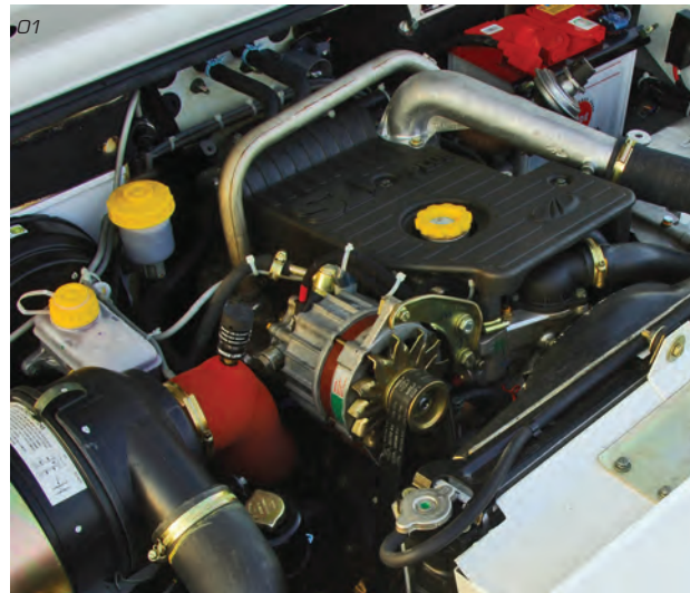
01 The Bolero's 2.5l NEF turbo diesel delivers 74 kW of power and 238 Nm of torque, pulling cleanly from 1800 rpm in third gear, providing great efficiency and excellent fuel economy across any terrain.