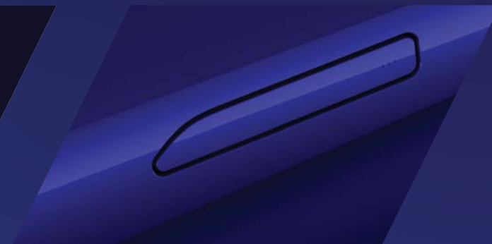
SMART DOOR HANDLES