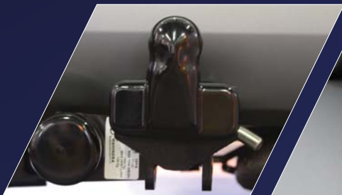
TOW BAR 14MH03CPA XUV7000 Bosal tow bar