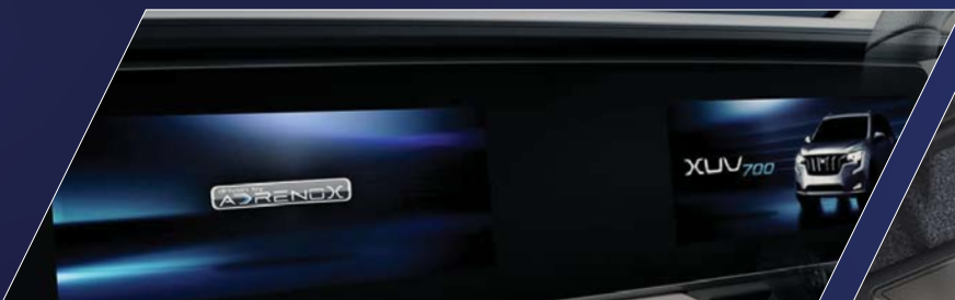
SCREEN PROTECTOR AW60095 Screen Protector Film XUV700