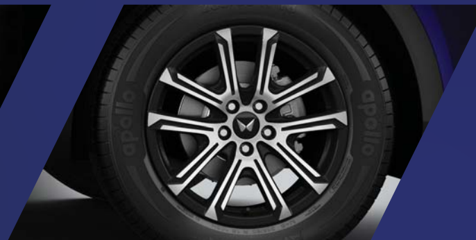
R18 DIAMOND-CUT ALLOY WHEELS