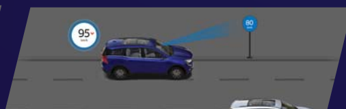
TRAFFIC SIGN RECOGNITION