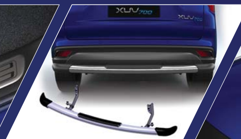
REAR PROTECTION AW60039 Rear Protector Kit - W601 - Stainless Steel