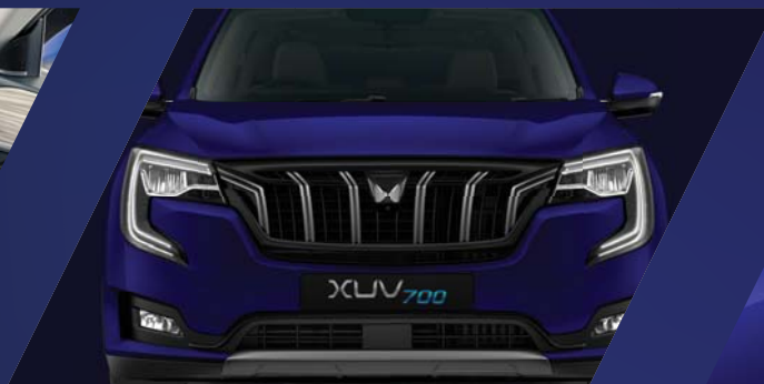
STRIKING CLEAR-VIEW LED HEADLAMPS WITH DRL AND SEQUENTIAL TURN INDICATOR