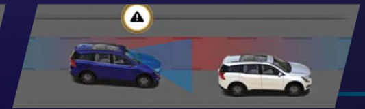
LANE KEEP ASSIST