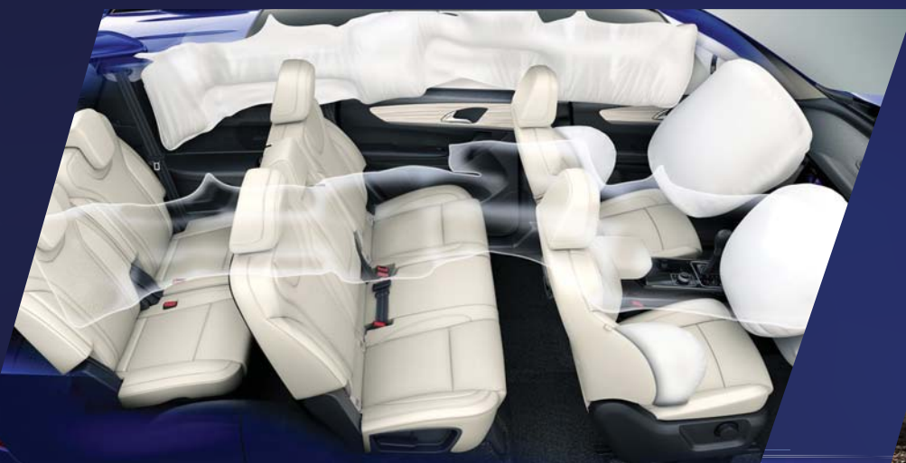
7 AIRBAG SAFETY