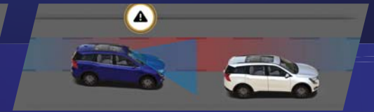
LANE DEPARTURE WARNING