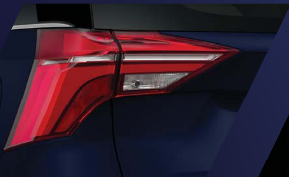
CAPTIVATING ARROW-HEAD LED TAILLAMPS