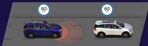
ADAPTIVE CRUISE CONTROL