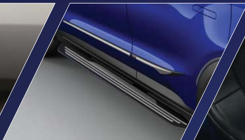
SIDE STEP AW60021 + AW60083 Side Foot Step Set W601