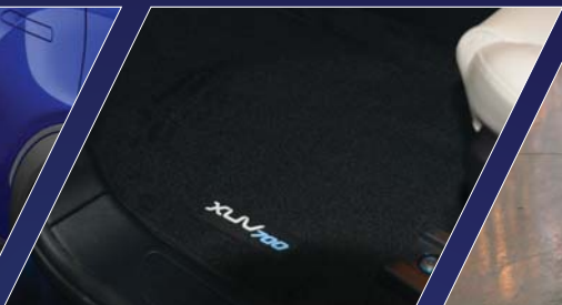
CARPETS CMHXUV700PLBOOT Floor mats, XUV700, Ultraplush