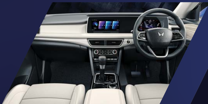
LUXURIOUS AND SOPHISTICATED INTERIORS

The new XUV700 is effortlessly impressive. From the style lines to the bold SUV stance, just one look is enough to give you a rush. Add the Skyroof™ and distinct LED lights, and you've got an SUV that can't be ignored.