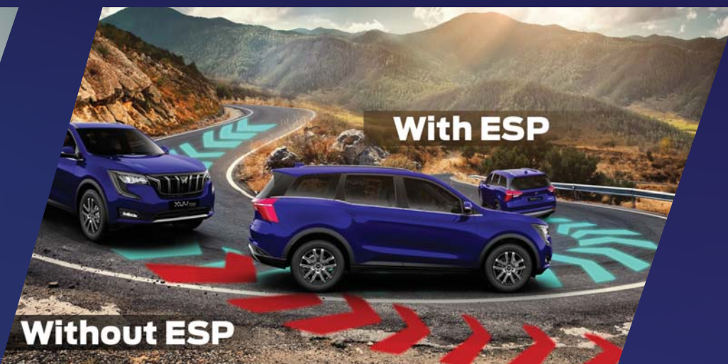
LATEST-GEN ELECTRONIC STABILITY PROGRAM

DRIVER DROWSINESS DETECTION • AUTO BOOSTER HEADLAMPS • PERSONALIZED SAFETY ALERTS • ELECTRONIC PARK BRAKE