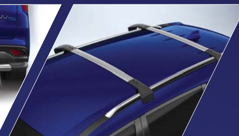
ROOF BARS AW60040 Roof Bar Set, W601