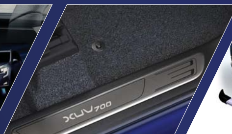
ILLUMINATED SCUFF PLATES AW60017 Illuminated Scuff Protector Set