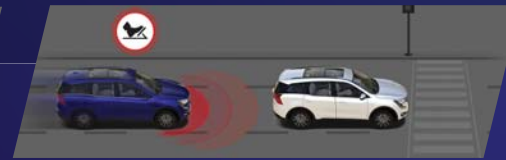
AUTOMATIC EMERGENCY BRAKING