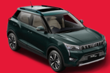
Aquamarine [on W4 only]